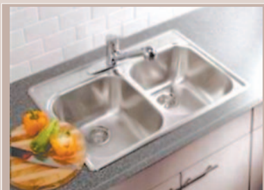
Essential Kitchen Sink $299