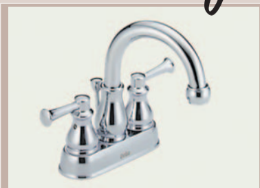
Ellington Faucet $152