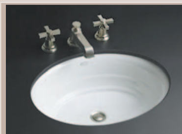
Garamond Undermount $199

Specializing in Kitchen & Bathroom Design • Flooring Ideas for Your Entire Home